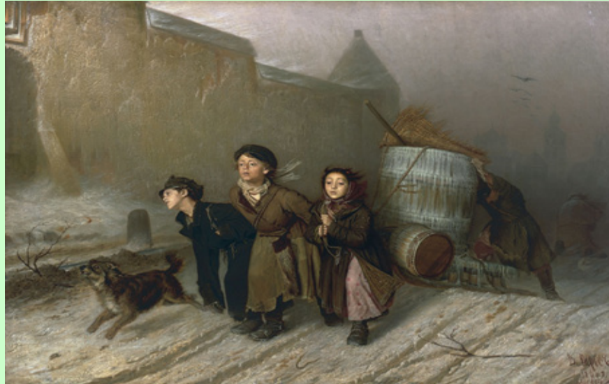
Source: Тройка - Василий Григорьевич Перов (1866), Vasily Perov, Wikimedia