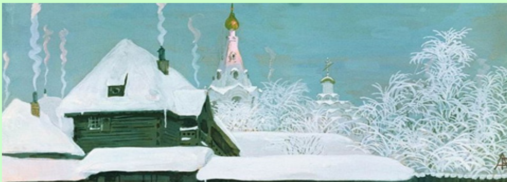
Ryabushkin - Winter morning. 1903, Andre Ryabushkin

(27) “Lord, forgive me a sinner; Lord, have pity on my poor unhappy mamma!”