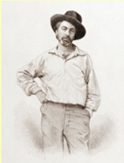
Source: Walt Whitman, steel engraving, July 1854

I, now thirty-seven years old in perfect health begin, Hoping to cease not till death.