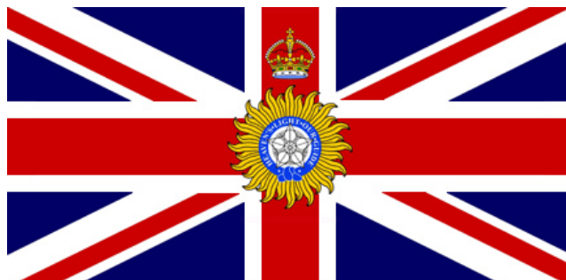
Source: Flag of the British Viceroy of India