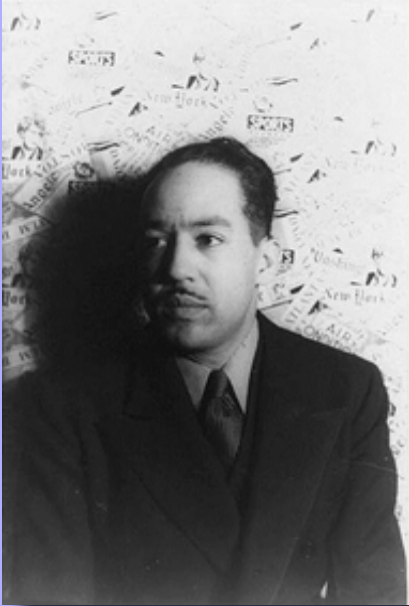
Source: Portrait of Langston Hughes

(1) She was a large woman with a large purse that had everything in it but hammer and nails. It had a long strap, and she carried it slung across her shoulder. It was about eleven o'clock at night, and she was walking alone, when a boy ran up behind her and tried to snatch her purse. The strap broke with the single tug the boy gave it from behind. But the boy's weight and the weight of the purse combined caused him to lose his balance so, instead of taking off full blast as he had hoped, the boy fell on his back on the sidewalk, and his legs flew up. The large woman simply turned around and kicked him right square in his blue-jeaned sitter. Then she reached down, picked the boy up by his shirt front, and shook him until his teeth rattled.